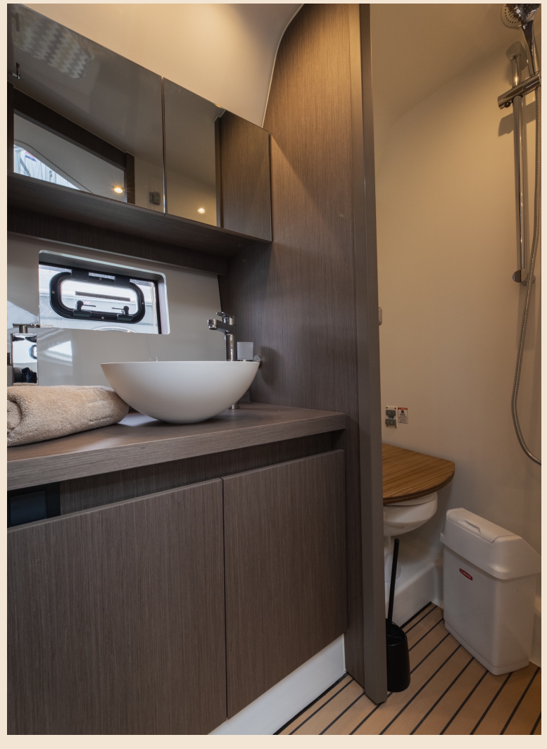
The 2 cabins and 1 bathroom easily accommodate up to 6 guests for an overnight stay.