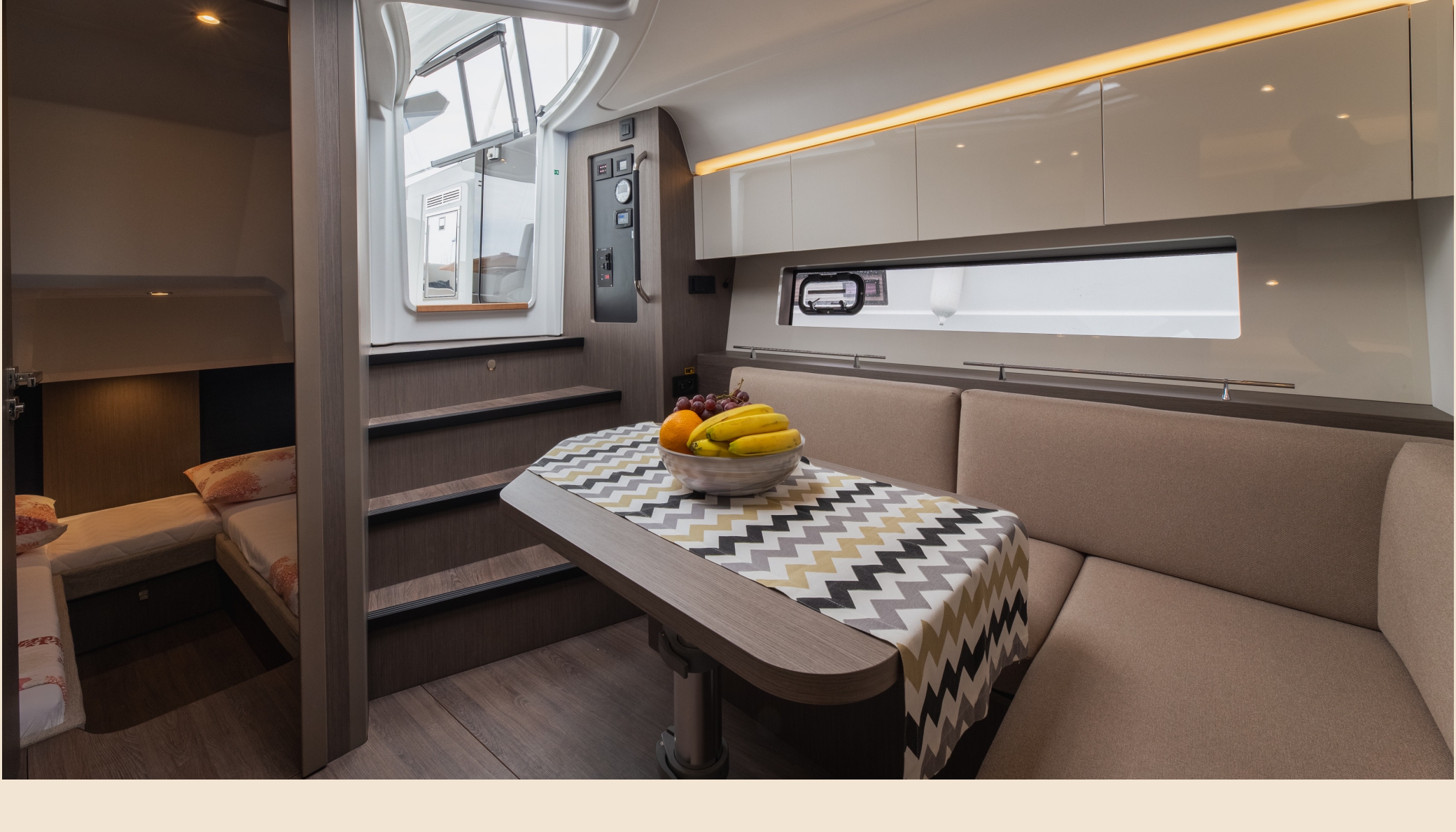
Enjoy comfortable, practical and spacious living spaces with lots of natural light.